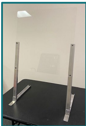
Table Top Sneeze Guards

Line up the holes and use two of the included screws to attach a leg to each side of the Plexiglas.